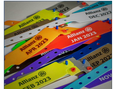
3. Coloured bands