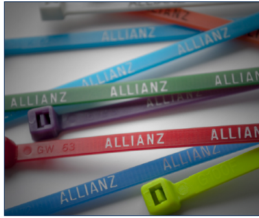
1. Coloured tags

Alternatively, visit us online at allianz.co.uk/specialservices for our full list of engineering services.