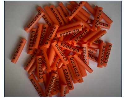
Coloured tag sleeves