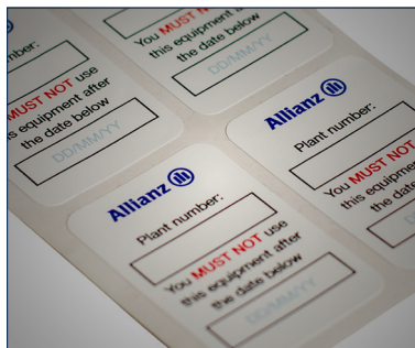
4. Inspection stickers