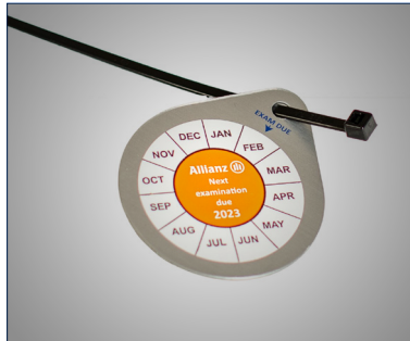
2. Aluminium disc with dated labels